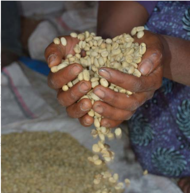
Ethiopia - Primrose worker