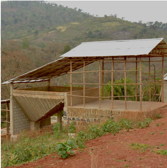
Ethiopia - Sidama