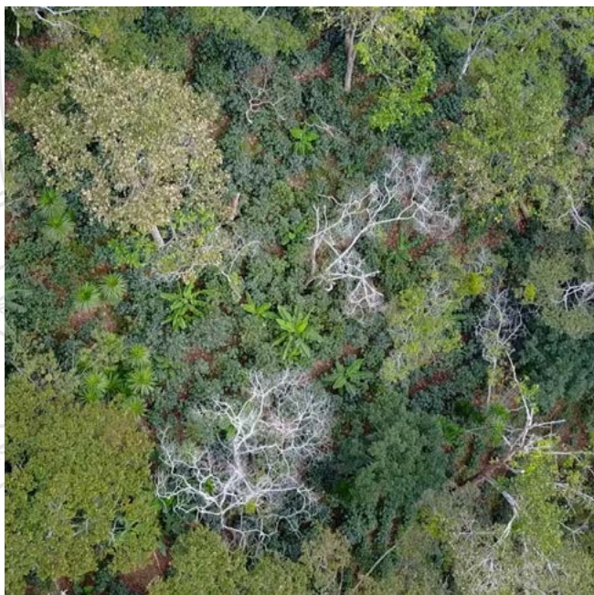
El Suyatal farm - Nicaragua