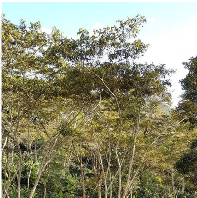
Los Alpes Farm - Nicaragua