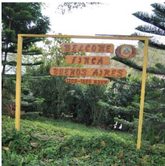
Buenos Aires farm - Nicaragua