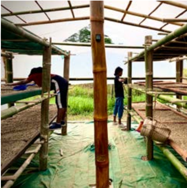
Drying beds – Aileu - Timor-Leste