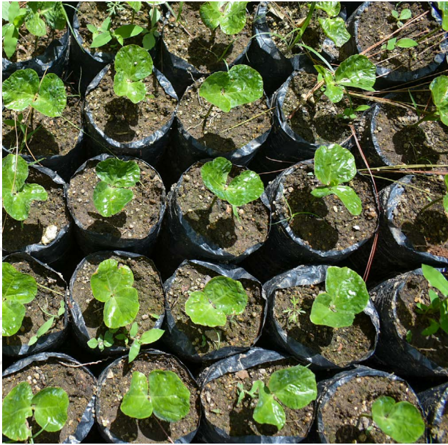
Sapling coffee trees - Nicaragua