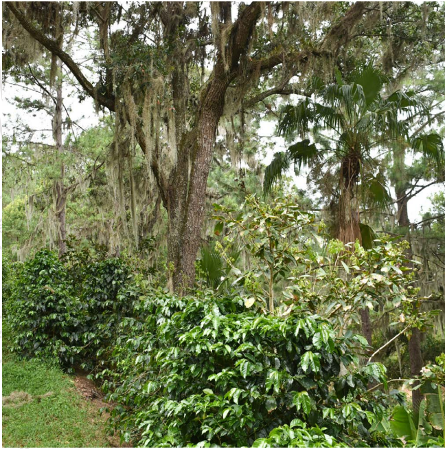
Los Suyates Farm - Nicaragua