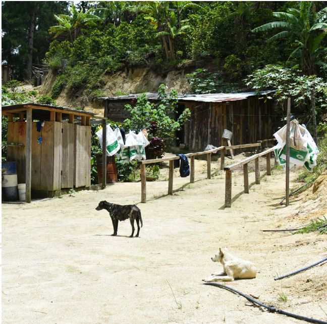
El Avi3n Farm - Nicaragua