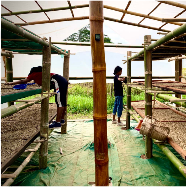
Drying beds – Aileu - Timor-Leste