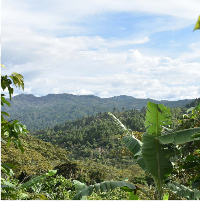
El Recuerdo Farm View - Nicaragua