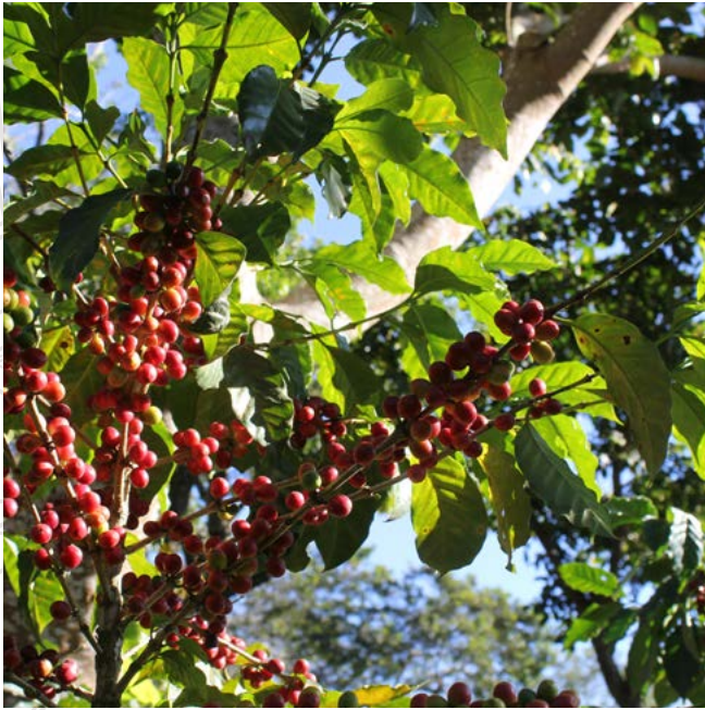
Finca Cruz Gorda - El Salvador