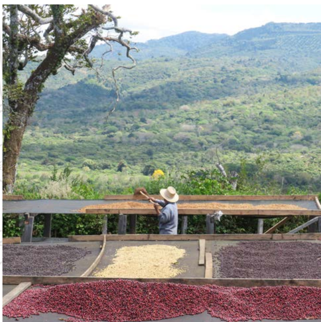
Divisadero drying beds - El Salvador