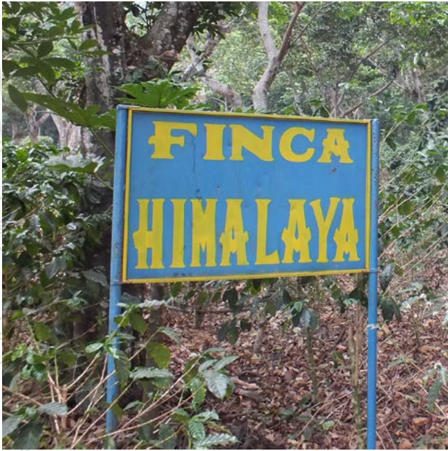
Finca Himalaya entrance - El Salvador