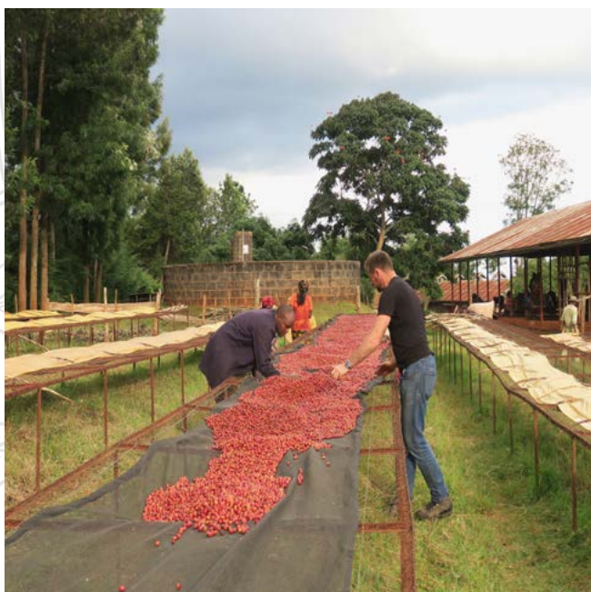
Coffee drying area at Thageini wet mill - Kenya