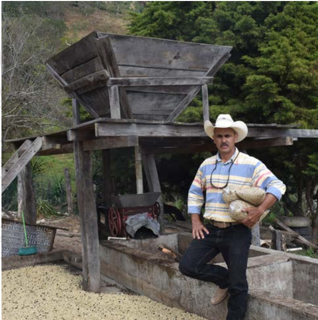
Los Pinos - Honduras