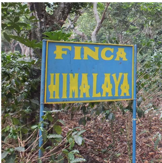
Finca Himalaya entrance - El Salvador