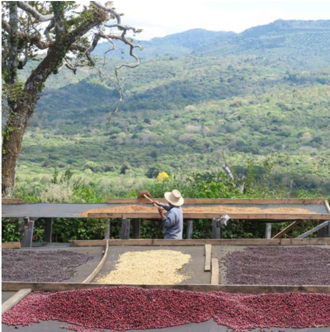
Divisadero drying beds - El Salvador