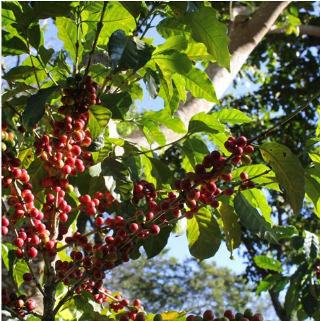
Finca Cruz Gorda - El Salvador